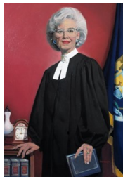
Hon. Dorothy Comstock Riley Served 1982–1983, 1985–1997