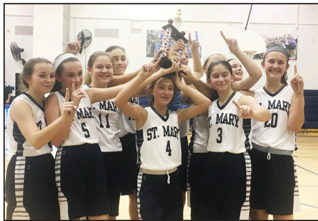
Winning the championship!