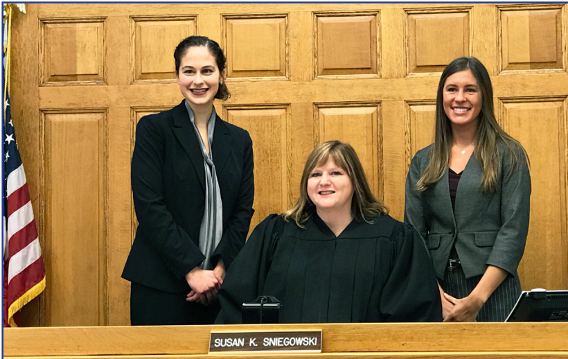
Judge Sniegowski with two of her former swimmers-- both of whom are now attorneys and one of whom she was able to swear in.

“I believe that engaging children in positive activities, such as youth sports or clubs, helps them develop into well-rounded individuals.”