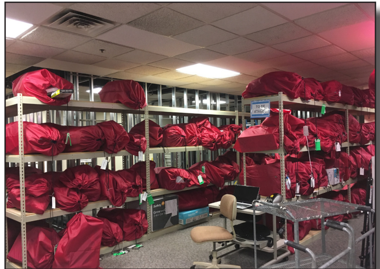
Dozens of bags of wrapped presents housed at the Friends of Foster Kids headquarters awaiting delivery to children in foster care in time for Christmas.