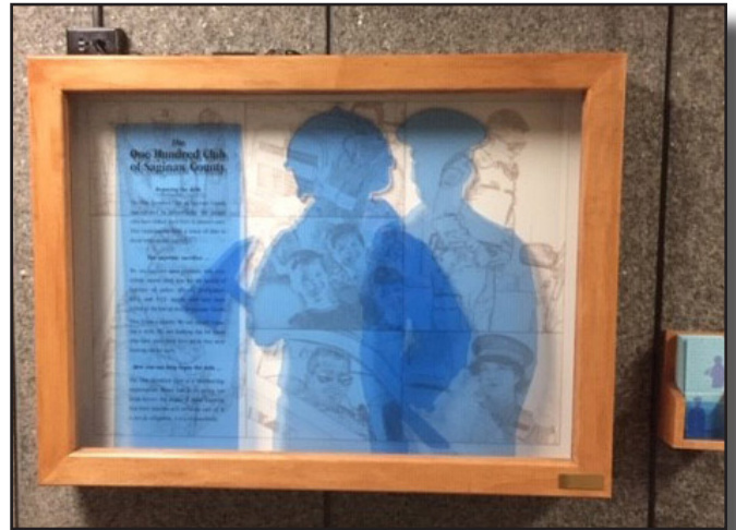
A commemorative plaque was donated to the 100 Club and now hangs in the lobby of Saginaw County Courthouse.

“Seeing what these two people do on a daily basis confirms the fact that the 100 Club of Saginaw County is a valuable and needed organization,” shared Judge McGraw. “Giving back is the least I can do.” ✎