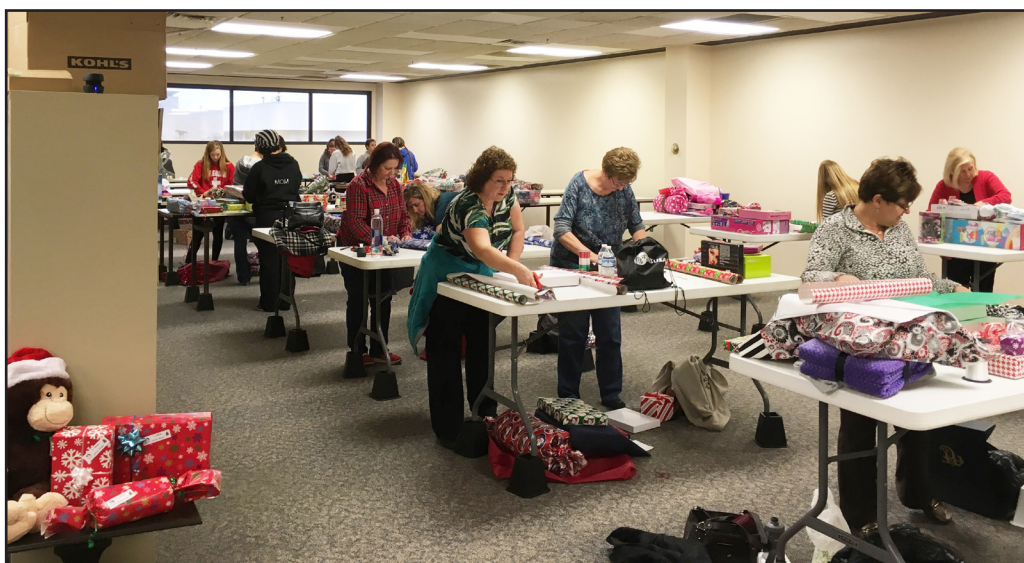
A well-oiled machine - “Angels” wrapping and bagging gifts.